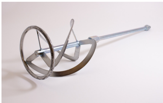
1. Mixing paddle to mix the dye provided by fade® with the fade® Acoustic Plaster.

+ Tools and equipment used for standard installations. Please see Method Statement for more information.