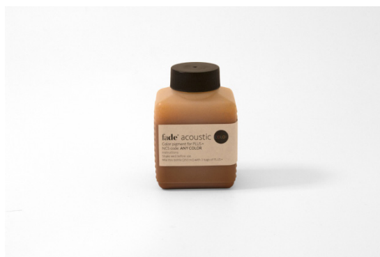
3. fade® Acoustic COLOR dye and pigment Colour dye and pigment provided by fade® in the NCS/RAL colour of your choosing.

*Please follow the instructions given out by fade®