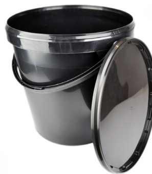
2. 50L mixing container (bucket) to mix the dye provided by fade® with the fade® Acoustic Plaster.

*Please follow the instructions given out by fade®